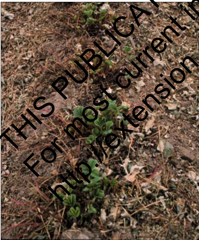
Figure 7. June-bearers about 2 weeks after renovation in mid-August.