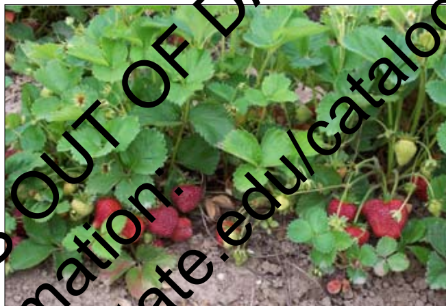
Figure 1. Tillamook, a June-bearing strawberry, in the second fruiting season.

You can choose from various cultivars (varieties) available for each type of strawberry.