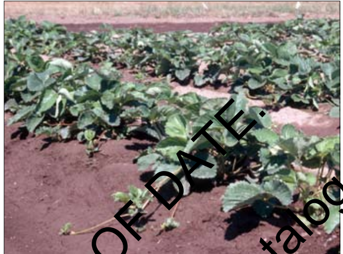
Figure 5. A hill system on raised bed. Runners should be removed at this stage, before rooting, to maintain the hill system.