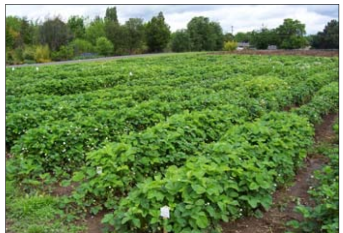
Figure 3. Matted row of June-bearing strawberry in the first fruiting season.