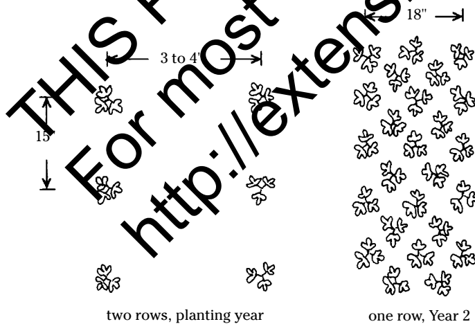
Figure 2. Proper spacing in the matted-row system.

The hill system is ideal for cultivars that produce few runners, such as everbearers and many day-neutrals, but it also can be used for June-bearers. Set plants 12 to 15 inches apart in double- or triple-wide rows (on raised beds if necessary). Aisles should be 1½ to 2 feet wide (Figure 4, page 4). In the hill system, cut off all runners every 2 to 3 weeks. It's best to wait until runners have formed a daughter plant but have not yet rooted (Figure 5, page 4). Removing runners before this time often encourages the plant to produce even more runners.