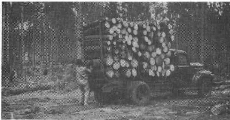
Figure 3.--Binding the loaded racks. ZM 79767 F