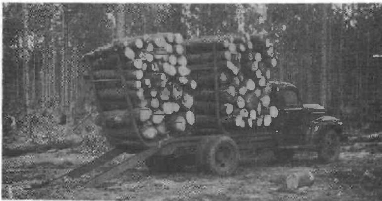
Figure 2.--Racks being loaded.