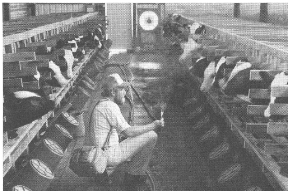
Figure 3.—The use of smoke sticks allows you to follow the air distribution within a room. Inlets play a very important role in proper distribution.

The animals will generally sleep in the best environment (warmest and best air) and dung in the coldest area. This requirement changes as the season changes from winter to warmer weather, and we ventilate for different purposes.