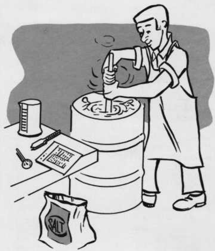
Be sure to mix thoroughly!

An easy way to prepare a brine solution of any given strength is to refer to Column 4 in Table 1 and then add the proper amount of salt per gallon of water. Salt will increase the volume of the solution, however. Thus, if an exact quantity of brine is needed, use Columns 5 and 6 to determine the weight of salt and