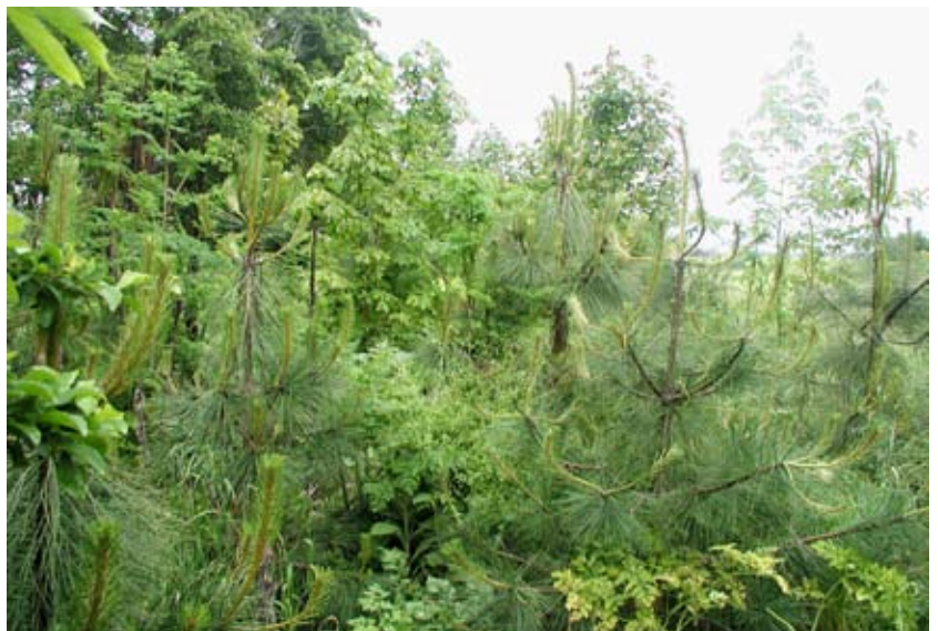
Figures 5, 6, and 7. —An example of replacing Himalayan blackberry with native trees. Site preparation included two mowings and an autumn application of glyphosate, made with a backpack sprayer. Postplanting treatments included spring spot-spraying with glyphosate and hand weeding. At top, the initial mowing, in May 2000. The Himalayan blackberry thicket was 4 to 8 feet tall on a terrace above Jackson Creek, adjacent to a farm field. Figure 6, center, is the same site in autumn 2001, after the first growing season. Note white alder and Oregon ash in the background. Species planted included ponderosa pine, bigleaf maple, Oregon ash, and Oregon white oak. Himalayan blackberry cover is minimal; competing vegetation is dominated by thistles and poison hemlock. Figure 7, bottom, is the site in spring 2005 from the same photopoint. Trees are well above competing vegetation and capable of dominating the site. Grasses have invaded the plot from the adjacent field; Himalayan blackberry is scarce within the treated area but is invading from the sides (the “edge effect”).