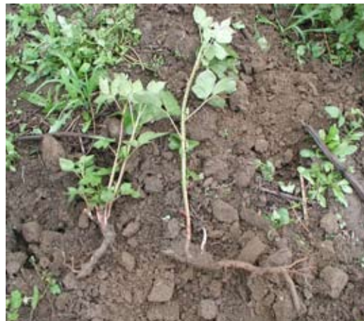
Figure 2 (at far left).—A root crown, or “burl,” of Himalayan blackberry. Many stout lateral roots and smaller, fibrous roots could have emerged from