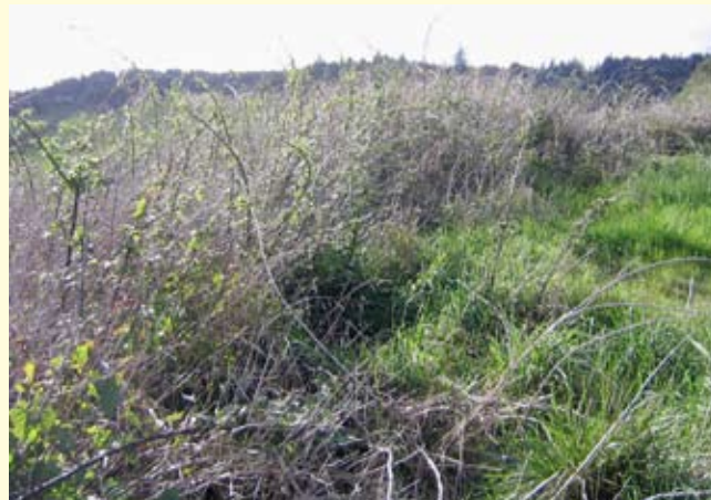
At top left, spores of the blackberry leaf fungus and (top right) the leaf spots that signal infection. Above, blackberry defoliated by the fungus.

on the most rust-resistant plants so they don't spread at the expense of more susceptible varieties. Since new information about the rust is emerging rapidly, riparian practitioners should consult with the Oregon Department of Agriculture or local experts before beginning blackberry control projects in areas where the rust is present.