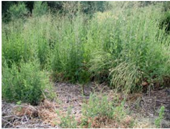
Figure 9. —A dense growth of thistles has invaded this site, initially a 6-foot-tall Himalayan blackberry thicket that was hand slashed and then grubbed to remove root crowns and

goats probably are best suited for Himalayan blackberry control in upland areas when: