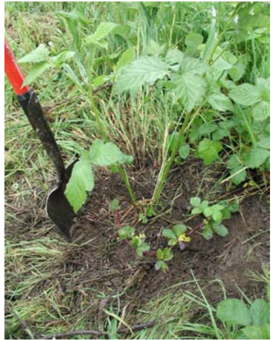
Figure 4.—A new blackberry cane, called a “daughter” plant, can root where another cane’s tip or nodes touch the ground.