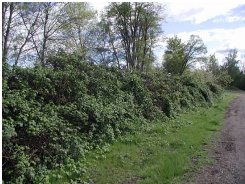
Figure 1. —If the Himalayan blackberry shown here is not checked, it could crowd out the existing trees and prevent new ones from establishing.

Another significant problem with the dominance of Himalayan blackberry is its effect on the development of streamside vegetation over time. Because of the intense competition for light, moisture, and other resources in Himalayan blackberry thickets, few new trees and shrubs can become established. Those that do are mainly root suckers of established plants. As short-lived riparian trees such as alder and black cottonwood die, they will not be replaced with younger trees (Figure 1). Thus many tree-covered riparian zones may be in danger of turning into shrub fields dominated by Himalayan blackberry.