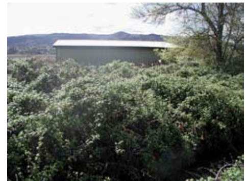
Figure 11.— Two seasons after cutting back Himalayan blackberry (at right), sandbar willow ( Salix exigua , below) is making a good recovery on the site.

Young seedlings can be hoed easily when their roots systems are not well established.