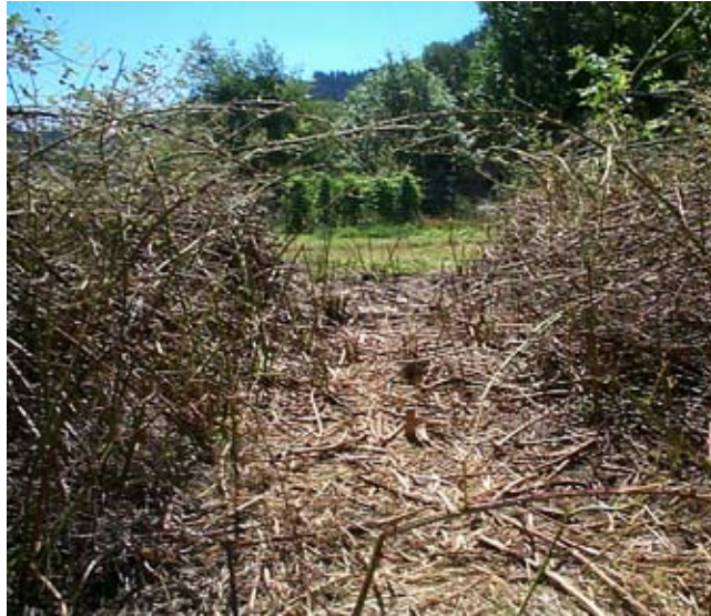
Figure 8.— Goats will eat succulent green leaves and canes of Himalayan blackberry but not dead, woody canes. Blackberry regrows rapidly after the goats leave the site.

Prescribed fire Burn either untreated thickets or mowed or cut areas that have regrown. During spring and summer, blackberry plant moisture content is high. It is lower in late fall and winter and may be easier to burn then. Note that burning permits are required in most localities, and other rules might apply; contact your municipal or county government for information.