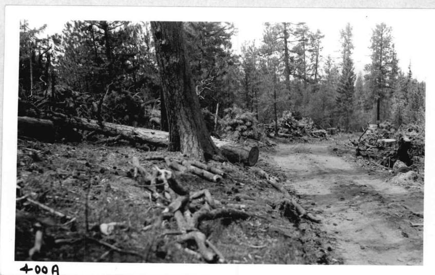
Fig. 3. Brush piled along road in strip method of disposal.