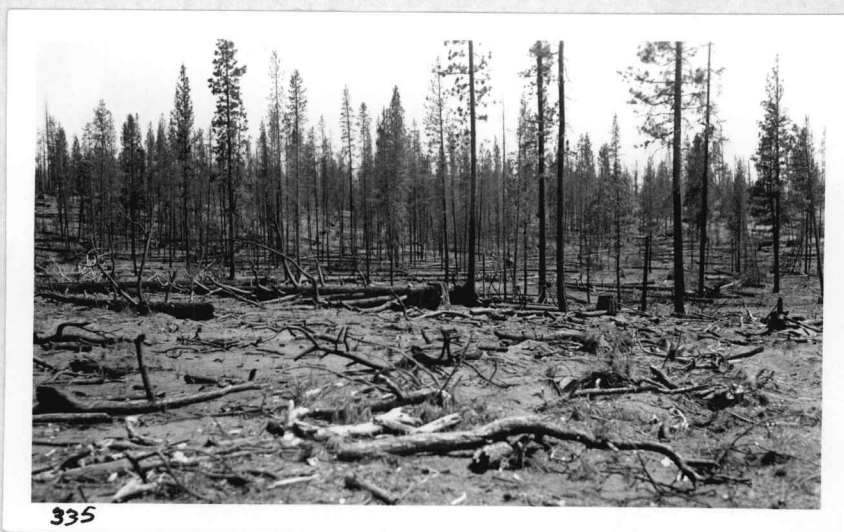
Fig. 5. An argument for broadcast burning?

Inasmuch as there is ordinarily an abundance of advance reproduction in the virgin forest, the question of how much is saved by undisposed slash or how much is destroyed by fire is dependent upon other considerations than silvicultural. It would be quite possible to destroy 50 per cent of the advance reproduction and yet retain sufficient number of trees to insure desirable conditions for a future crop. Of course this does not mean that every area has an abundance of growth and that indiscriminate burning may be practiced.