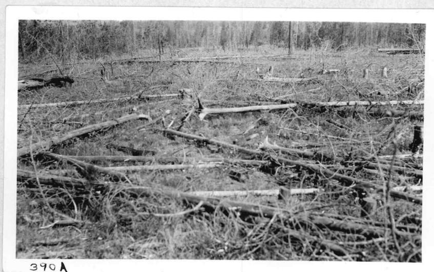
Fig. 4. What happens sometimes in broadcast burning.