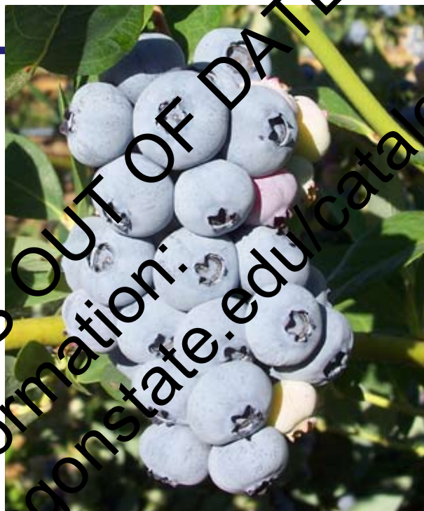
Fluitt (northern highbush)

Rabbiteye blueberries ( V. virgatum , syn. V. ashei ) are native to the southeastern U.S., where plants grow from 6 to 10 feet tall. Rabbiteye cultivars were developed in regions with long, hot summers, and they behave differently in the Pacific Northwest than in