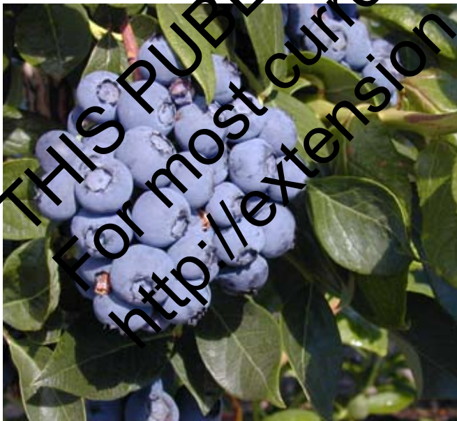
Duke (northern highbush)

Although most commercial blueberry production in the Pacific Northwest is west of the Cascades, northern highbush blueberries are successfully grown in some areas of Idaho and eastern Oregon and Washington. In these regions, growers must contend with shorter growing seasons and colder winter temperatures than