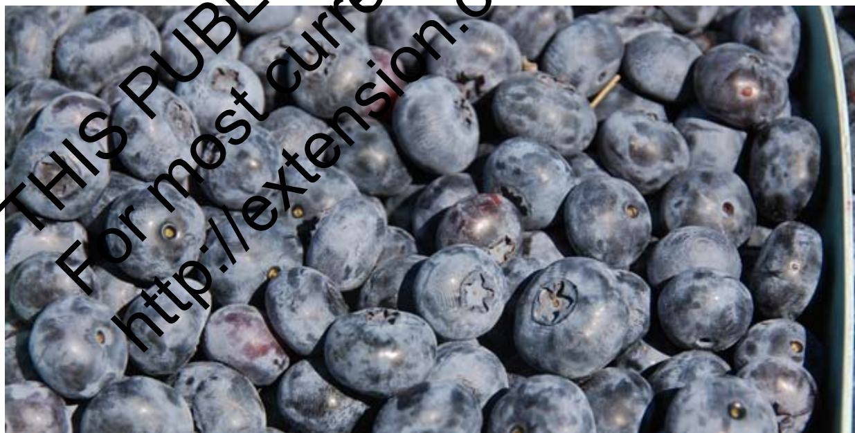
Liberty (northern highbush)

Cultivars that are well suited to home garden production are noted as such. See Growing Blueberries in Your Home Garden , EC 1304 (revised 2008).