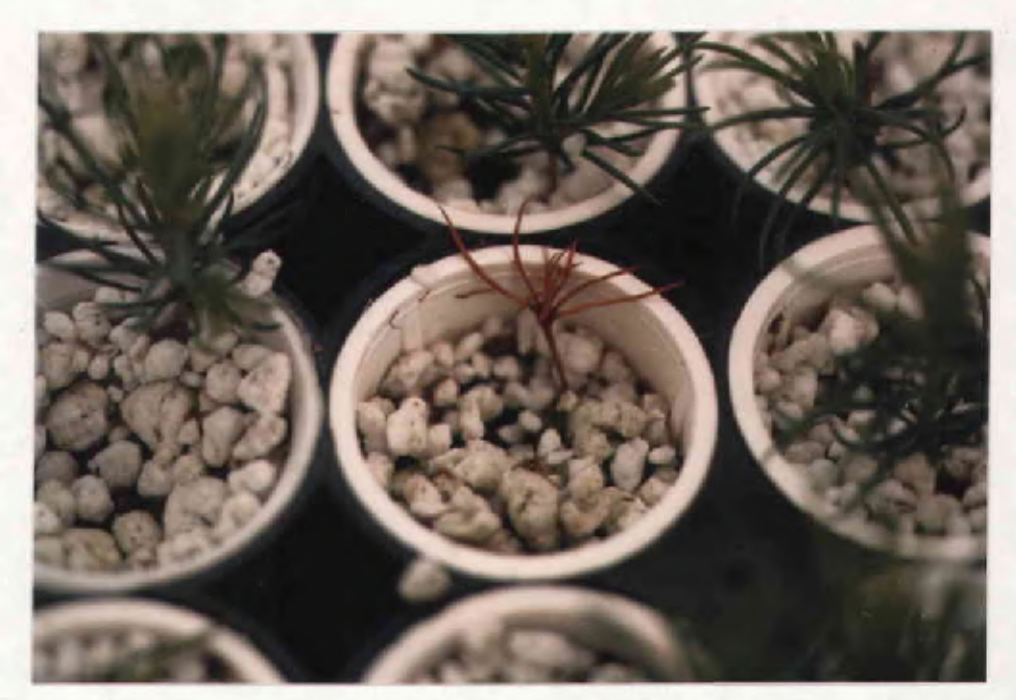
Figure 1.—One-month-old containerized Engelmann spruce seedling infected with <u>S. strobilinus</u> at the Coeur d'Alene Nursery, Idaho. Necrotic seedlings remained upright and black pycnidia were found at the base of infected needles.