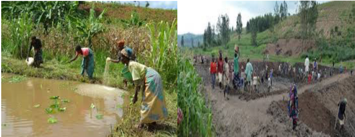
Figure 2: Women feeding the fish and engaging in pond preparation with their fellow men