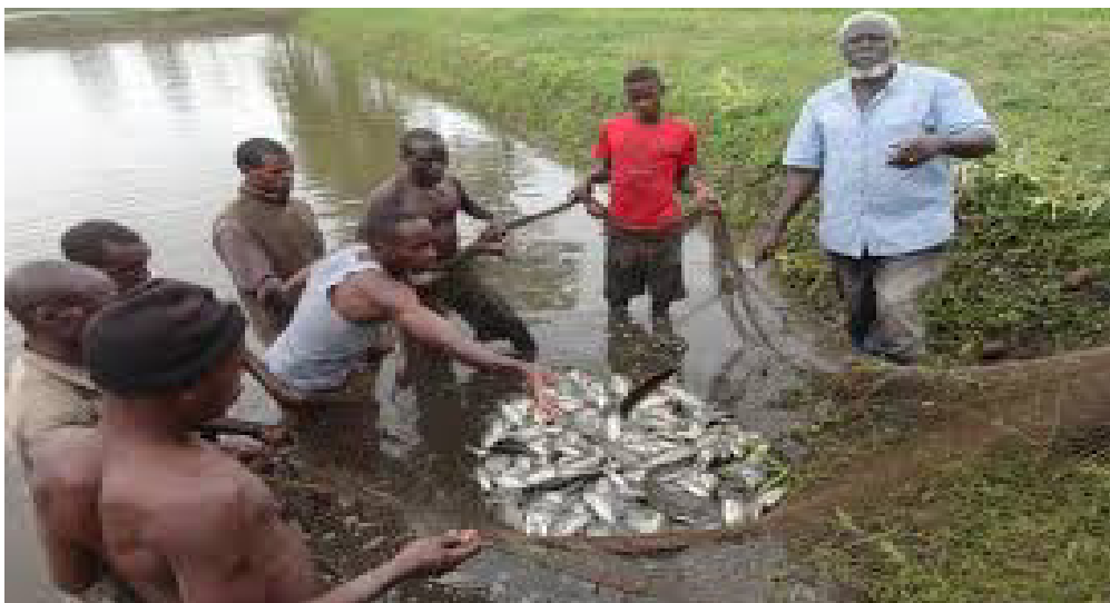
Fig 4: Cropping in a pond