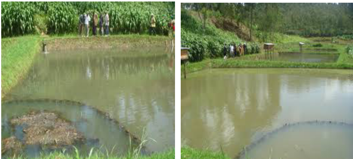
Figure 3: Some fish ponds (source field study)

processing and products development could be attributed to the artisanal nature of the fisheries and lack of fish to process by women in Rwanda. The small amount of fish caught on the lake are all sold right at the lake side with nothing left to sell in urban centres and this selling exercise is generally dominated by females. It was found that the small quantities of Isamabaza ( L. miodon ) landed in Rusizi and Nyamasheke were weighed and immediately bought by small female traders who packed them in basins and carried for sale in Bukavu across the border in Democratic Republic of Cong (DRC). The same scenario prevailed in Rubavu District where most of the fish caught on the Rwanda side are sold by businesswomen in Goma. This kind of undefined marketing can be a loophole for loss of revenue if there were substantial quantities of fish. But it is also an indication of availability of a regional market for fish which is good opportunity for most females who wish to venture in selling fishes (Shirajjee et al. ,2010)