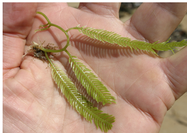
Caulerpa found on the west shore of Pittwater, northern outskirts of Sydney.