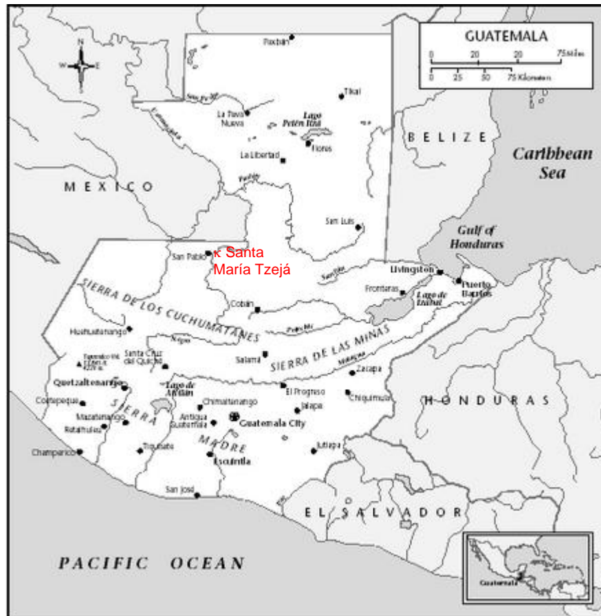
Figure 1 – Map of Guatemala (Countries and their Cultures)

The Ixcan region is located in the Northwestern part of Guatemala bordering the southern edge of Mexico.