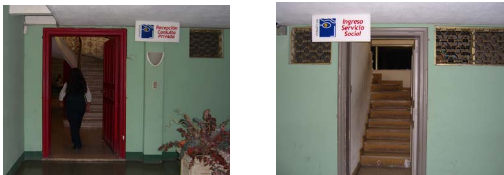
Figure 4 – Pictures of Visualiza Private and Social entrances

Cataract surgery for a private patient is about $735 more than for a public patient. Social patients pay an “at cost” rate of $65, meaning that the doctors and staff do not get paid for these surgeries. Enfoque Ixcan pays 85% of the eye care services and costs associated with eye care for the patients referred to Visualiza from the Ixcan. The additional cost per patients is roughly 255 Quetzals ($34) which includes fifteen percent of the transportation, lodging, meals and accompanier. The accompanier is paid separately, and the surgery costs are covered directly by Enfoque Ixcan. The difference in surgery costs at Visualiza compared to those in the United