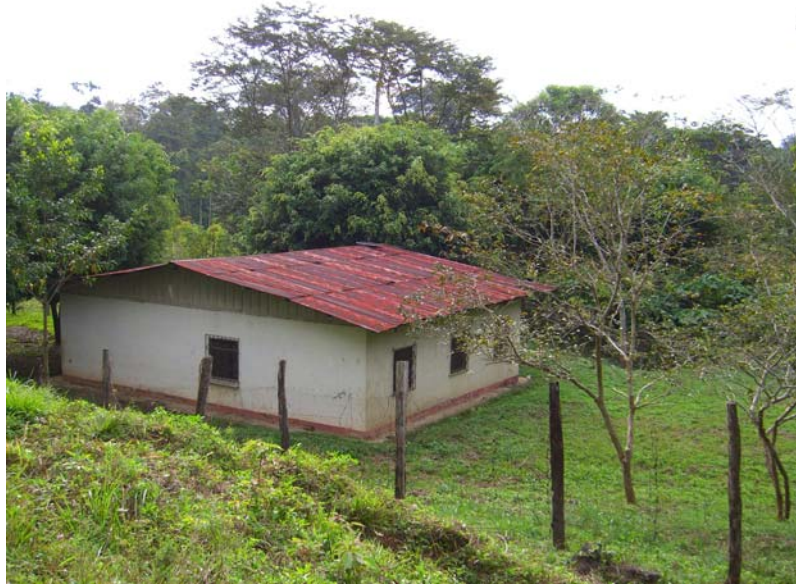
Figure 3 – Picture of Santa María Tzejá Health Post

building, like the village, does not have running water or electricity. The one hanging-bulb light in the center of the Health Post is run by a generator but is only lit when absolutely needed.