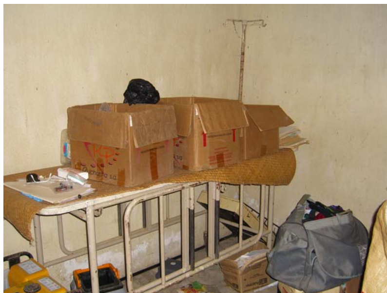
Figure 7 – Picture of Enfoque Ixcan supplies in Health Post storage room

special security for these products besides the Health Post's normal locked doors and windows. Enfoque Ixcan's Board of Directors has discussed building a locked cabinet to hold Enfoque Ixcan supplies and equipment.