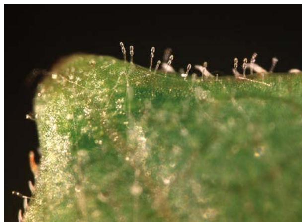
Figure 5. Look for chains of conidia with your hand lens to confirm powdery mildew. Note that the mycelium is very sparse in this colony.

Flag shoots may be found well before you plan to start your fungicide program. This is a serious situation requiring quick action. Remove the shoot and either bury it on site or place it in a sealable plastic bag so you do not spread spores to other areas of the vineyard. Removal of the flag shoot is good, but spores may have been distributed already, and infections may have started that are not yet visible. For this reason,