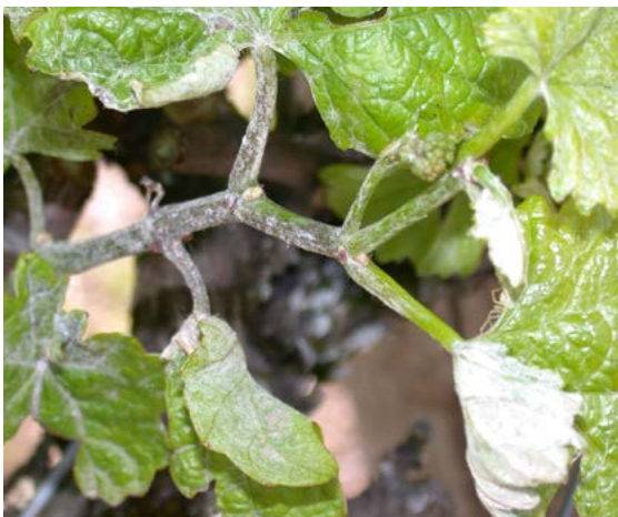
Figure 6. Flag shoots of powdery mildew soon after bud break in the spring.