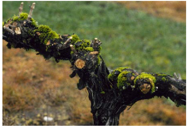
Jay W. Pscheidt

During the early stages of epidemics, symptomatic leaves are often confined to the canopy interior, close to trunks or cordons. Knowing this, you can focus your search on leaves that are closest to trunks, cordons, and head regions of the vine (Figure 3). A quick stop in a high-vigor area of your vineyard to search basal leaves may be all that is needed. Go straight to the head region