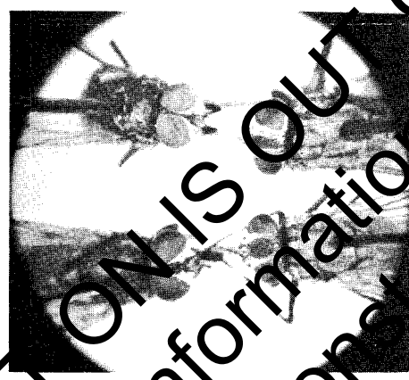
—ROLAND H. PEETMAN, UNIVERSITY OF IDAHO Top: face flies; Bottom: house flies. The face fly closely resembles its near relative, the common house fly. The most noticeable differences are in their faces. Eyes of the male face fly (top left) almost touch, while those of the male house fly (bottom left) are separated by a dark, hairy patch. A similar dark, hairy patch between the eyes is characteristic of the females of both species. However, note that in the female face fly (top right), the patch is narrow, covering only about one-third of the area between the eyes, while in the female house fly (bottom right), it is wide, covering more than half the area between the eyes.

domen. The female face fly has an orange stripe on the abdomen. Both face flies and house flies may be found on the faces of cattle, and both may be found resting on the outside of buildings, fence posts, and similar places.