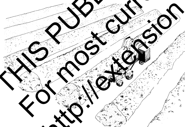
Figure 2.—Windrow composting with an elevating face windrow turner.

It is legal to compost dead animals in Oregon; however, you must have a composting plan on file with the Oregon Department of Agriculture. The plan must include a drawing of your composting area, a description of how runoff from the compost piles will be contained, a description of the