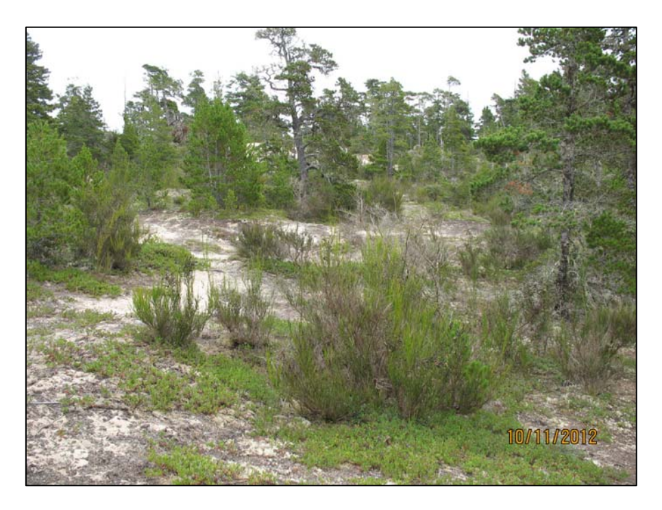
Figure 8. Infilling of shore pine / bearberry association by Scots broom, Eel Creek area, October 2012.

Figure 7. Former high-quality stand of red fescue observed in 1993, being overrun by European beachgrass and shore pine, Eel Creek area, October 2012.