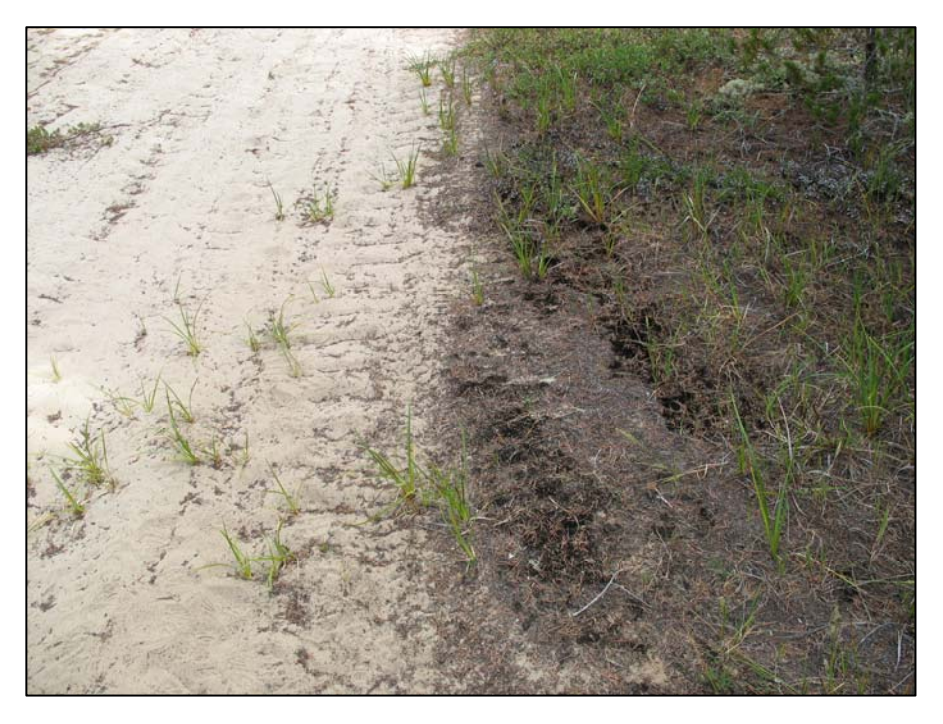
Figure 3. Edge of OHV trail, Heceta Sand Dunes ACEC/ONA, August 2006.