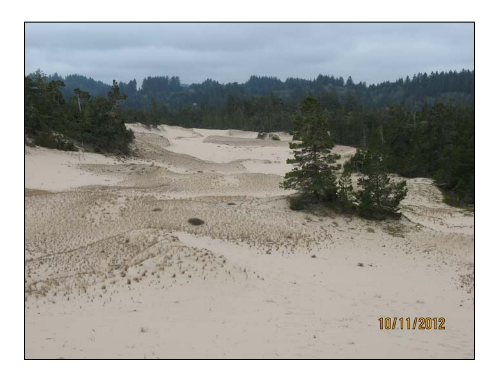
Figure 10. Same site as Figure 8, October 2012.