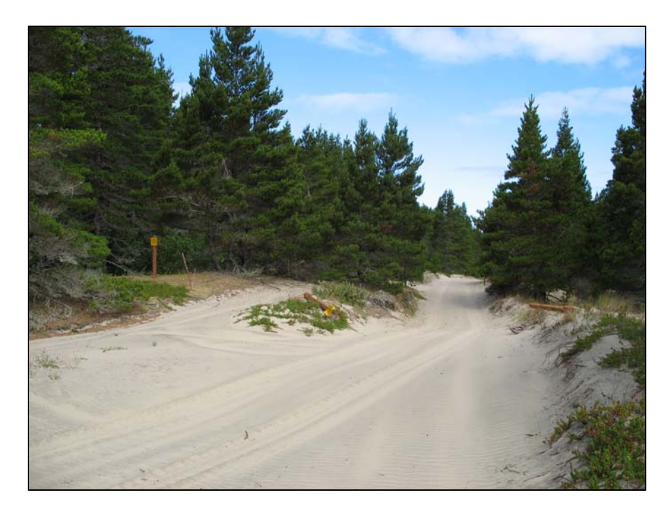
Figure 1. Ongoing use of OHV trails despite posted closure, Heceta Sand Dunes ACEC/ONA, August 2006. Two of three BLM boundary signs were knocked down.