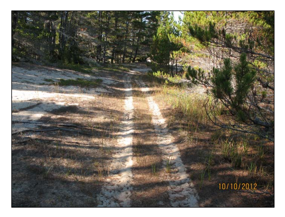
Figure 4. Same site as Figure 3, October 2012. Width of trail has diminished since 2006.