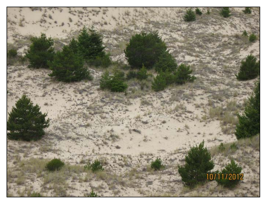
Figure 7. Former high-quality stand of red fescue observed in 1993, being overrun by European beachgrass and shore pine, Eel Creek area, October 2012.