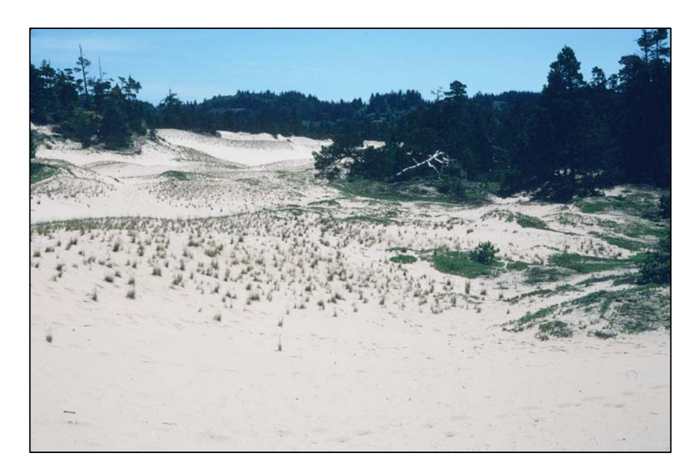
Figure 9. Red fescue association south of Eel Creek Campground, June 1993.