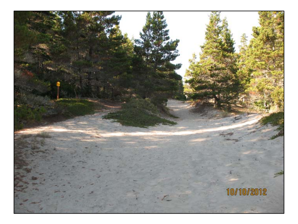
Figure 2. Same site as Figure 1, October 2012. One BLM boundary sign remains.

Figure 1. Ongoing use of OHV trails despite posted closure, Heceta Sand Dunes ACEC/ONA, August 2006. Two of three BLM boundary signs were knocked down.