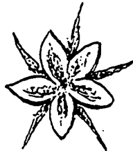
Seed pod, open, and star-shaped. (x2).