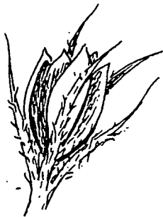
Seed pod, closed (x5).

Does it resemble anything else? A young plant resembles a miniature rabbitbrush. It has woody stems and branches like rabbitbrush, but they grow flat on the ground instead of standing straight up. No other plant makes such a dense mat, prickly to the touch, resembling heather a little. But heather does not grow on the arid ranges. No rainfall area in Oregon is too dry for some form of Phlox.