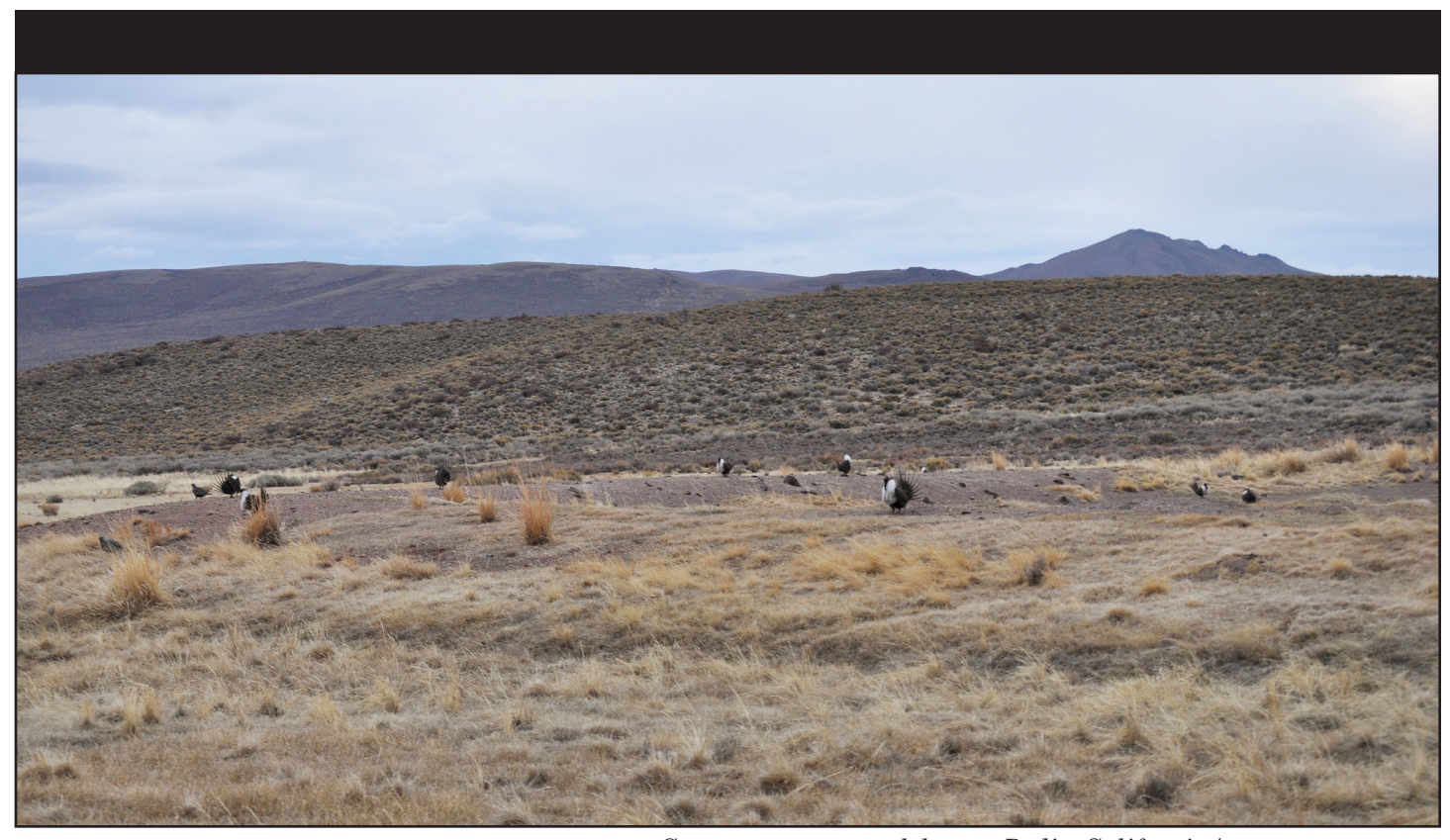
Greater\ sage-grouse\ lek\ near\ Bodie,\ California

transition or the collapse of the Great Basin ecosystems into a system dominated by invasive annual grasses. Such an outcome will not be good for any of the native wildlife species or the people that depend on these uniquely western sage-steppe habitats. Mule deer, sage sparrows, pygmy rabbits cutthroat trout, spotted frogs, many reptiles, and a host of other native plant and animal species are also at risk.