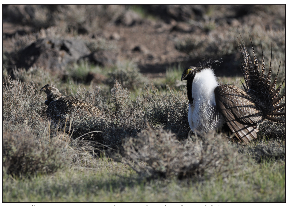
Greater sage-grouse male struts for a female at a lek

A holistic approach involving efforts across disciplines and across organizational and administrative boundaries is necessary to prevent the