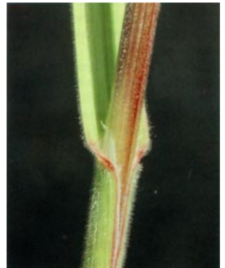
Figure 2.—Magnified view of the collar region of a downy brome culm showing characteristic pubescence.

Downy brome is a major weed problem in winter wheat, perennial grass seed, and alfalfa in much of the Pacific Northwest and Great Plains. Downy brome infestations of 10 and 50 plants per square foot can reduce winter wheat yields by 40 and 92 percent, respectively. Downy brome is especially troublesome in drier production areas where crop rotations are mostly limited to winter wheat followed by a year of summer fallow (winter wheat-summer fallow rotation).