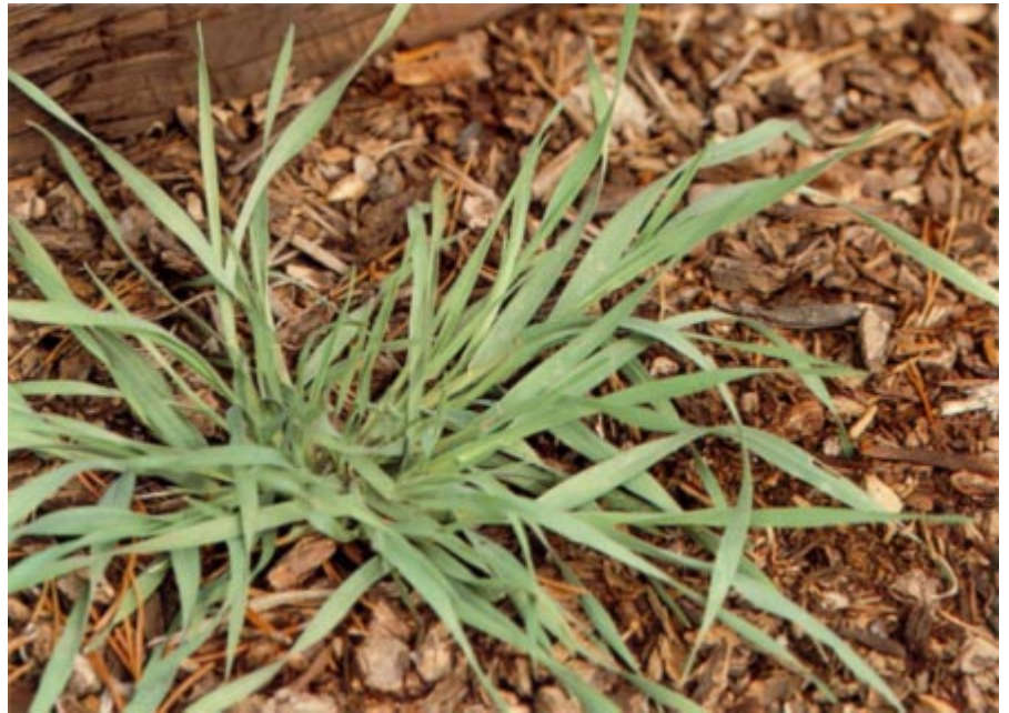
Figure 1.—Downy brome in the vegetative growth stage.