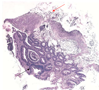
Figure 2 Low power view of a mucosal fragment. Histopathology shows: at the bottom, tubular structures lined by columnar epithelial cells with pseudostratified nuclei, consistent with low grade tubular adenoma (black arrow); at the top, ballooned crypts and intercrypt necrosis, an exudate featuring the classical "volcano" lesion (red arrow) surrounded by a laminated pseudomembrane composed of neutrophils, mucin and fibrin (hematoxylin and eosin, x 100).

clinical course and the study with EIA, PCR and toxigenic culture confirmed an association with C. difficile and the response to treatment with oral metronidazole was concordant.