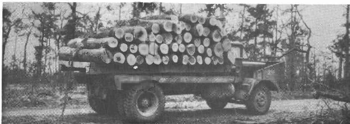
Figure 3.--Rack loaded and ready for transport.