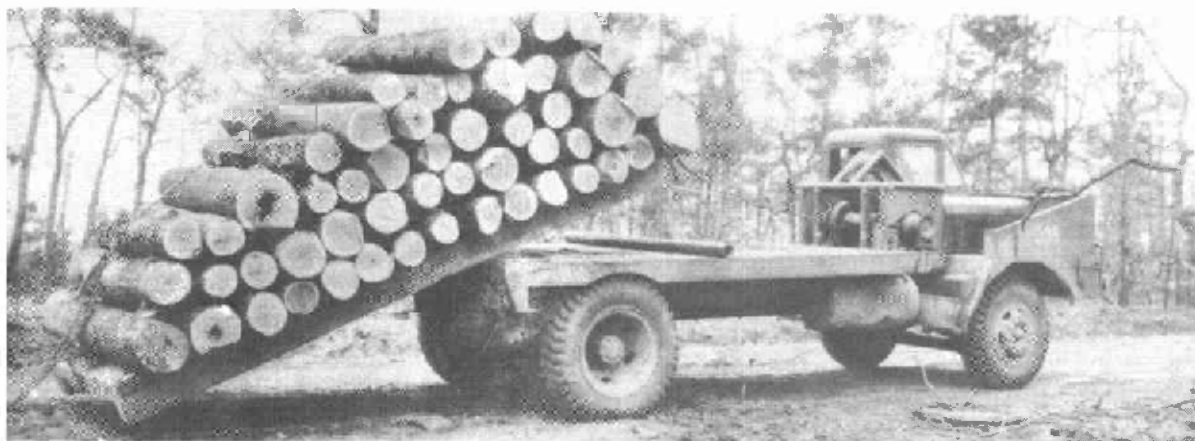
Figure 2.--Loaded rack being pulled onto truck.