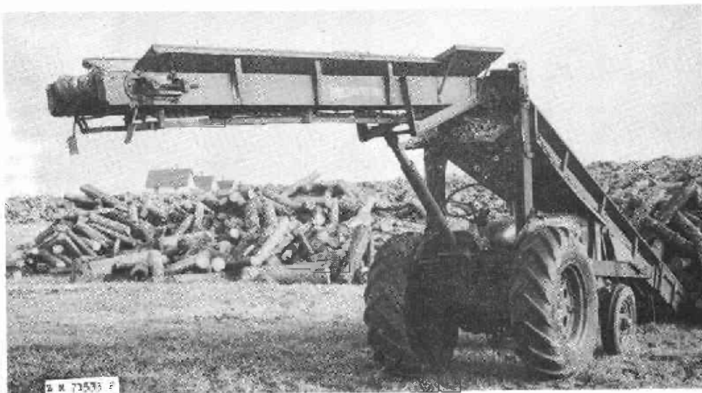
Figure 2.--Mobile pulpwood conveyor mounted on wheel tractor.