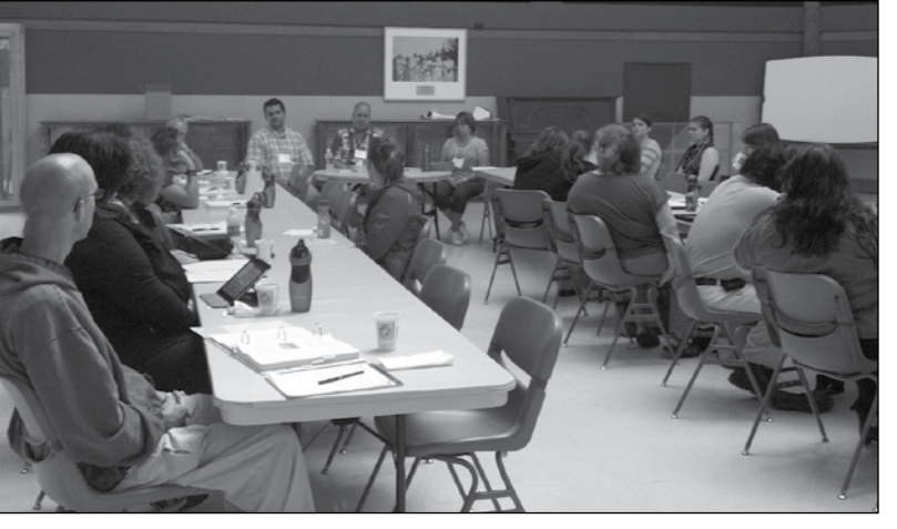
Facilities planning session at the Siletz Tribal Community led by tribal archivists.

The visits lasted from a few hours to a day, each revealing more about the archives and records management programs that existed and the communities themselves. At the Confederated Tribes of Grand Ronde, they met with members of the cultural resources