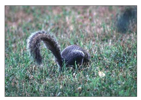
Squirrels often bury nuts in the fall to eat during the winter.