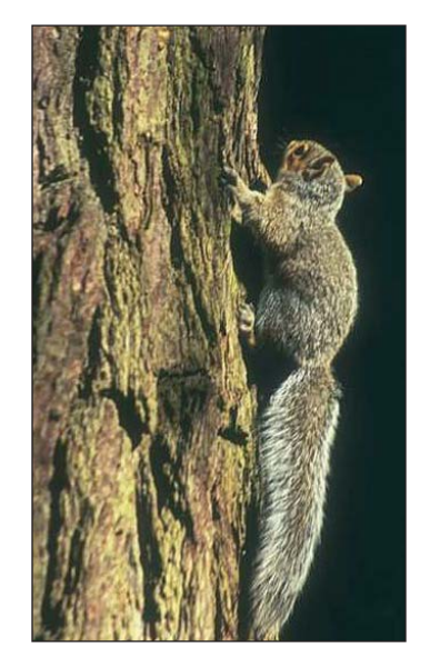
Squirrels eat, sleep, and raise their babies in trees.

Squirrels are like miniature tree farmers. They help new trees grow by storing nuts and seeds in the ground, hoping to eat them later. If they forget where they hid them, the seeds can sprout