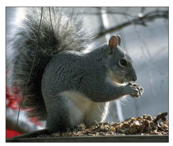
Squirrels are fun to watch. They love to climb trees and eat at feeders.