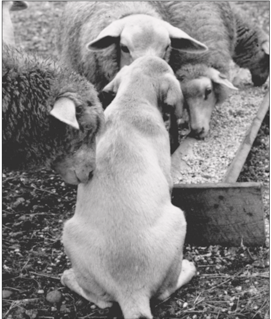
Figure 4b.—The pup's sitting posture is another aspect of submissive behavior, this time with a touch of curiosity—what are those sheep eating?