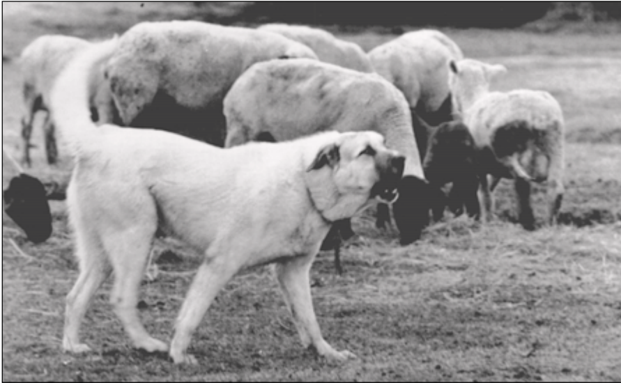
Figure 3.—This is a display of approach-withdrawal behavior. There's real uncertainty here: The dog's hackles and tail are raised in a posture of dominance or aggression, but his ears are back and he avoids eye contact with the intruder—postures of submission. The dog circles between sheep and intruder. Will this display become aggressive? The chance that it might is enough to ward off most predators. Note how calmly the sheep are feeding in the background.