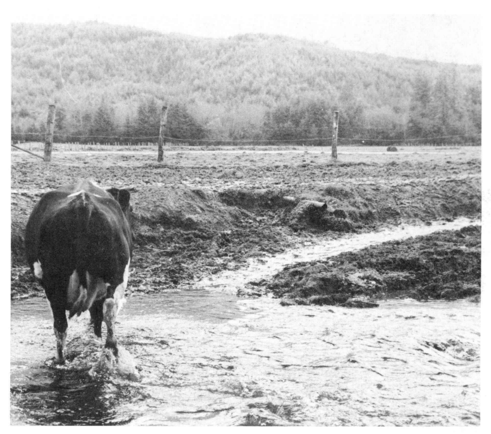
Figure 1.—Livestock should not have unlimited access to a stream. Relocating fences or providing another source of water can prevent or minimize manure deposited directly into the stream.

Use curbs, dikes, ditches, or channels to intercept and reroute upslope runoff around the lot (figure 2). Rain and snow can still fall on animal lots and become polluted. You must collect, store (usually), and apply this water to your land properly. Use water bars to divert runoff flowing down a road-