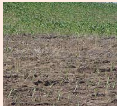
Figure 1. Armyworm damage on grass.

Armyworm populations usually are kept well below levels of economic concern by naturally occurring biological controls (including parasitic flies and wasps) and cool or cold weather.