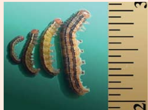
Figure 8. Control is most effective and economical on smaller larvae ( \frac{1}{4} inch).