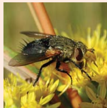
Figure 9. Tachinid fly parasites of armyworm are about the size of houseflies and are active at night.

Malathion , carbaryl , and Baythroid are registered for use on grasses grown for pasture, hay, and silage. Baythroid and malathion are restricted-use pesticides, so applicators must have state certification and an appropriate applicator’s license from the Oregon Department of Agriculture. Baythroid is the more effective product. Check all labels for use rates, restrictions, and application methods. Sevin (carbaryl) is a registered control method but gives poor control of armyworms.