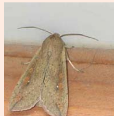
Figure 3. Armyworm moth. Note the small white dot on each forewing.