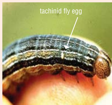
Figure 7. Egg of tachinid fly parasite on armyworm larva.