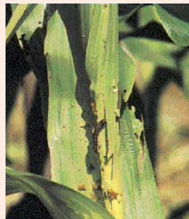
Figure 2. Armyworm damage on corn.