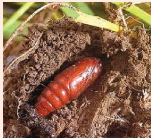
Figure 5. Red, torpedo-shaped pupa of the armyworm.