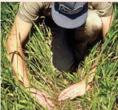
Figure 6. Armyworm larvae remain in the soil or under leaves during the day. Look carefully!

Five to 10 armyworm larvae per square foot in pasture grass probably justifies control. Increasing armyworm numbers and no signs of parasites also indicate a need for applied control.