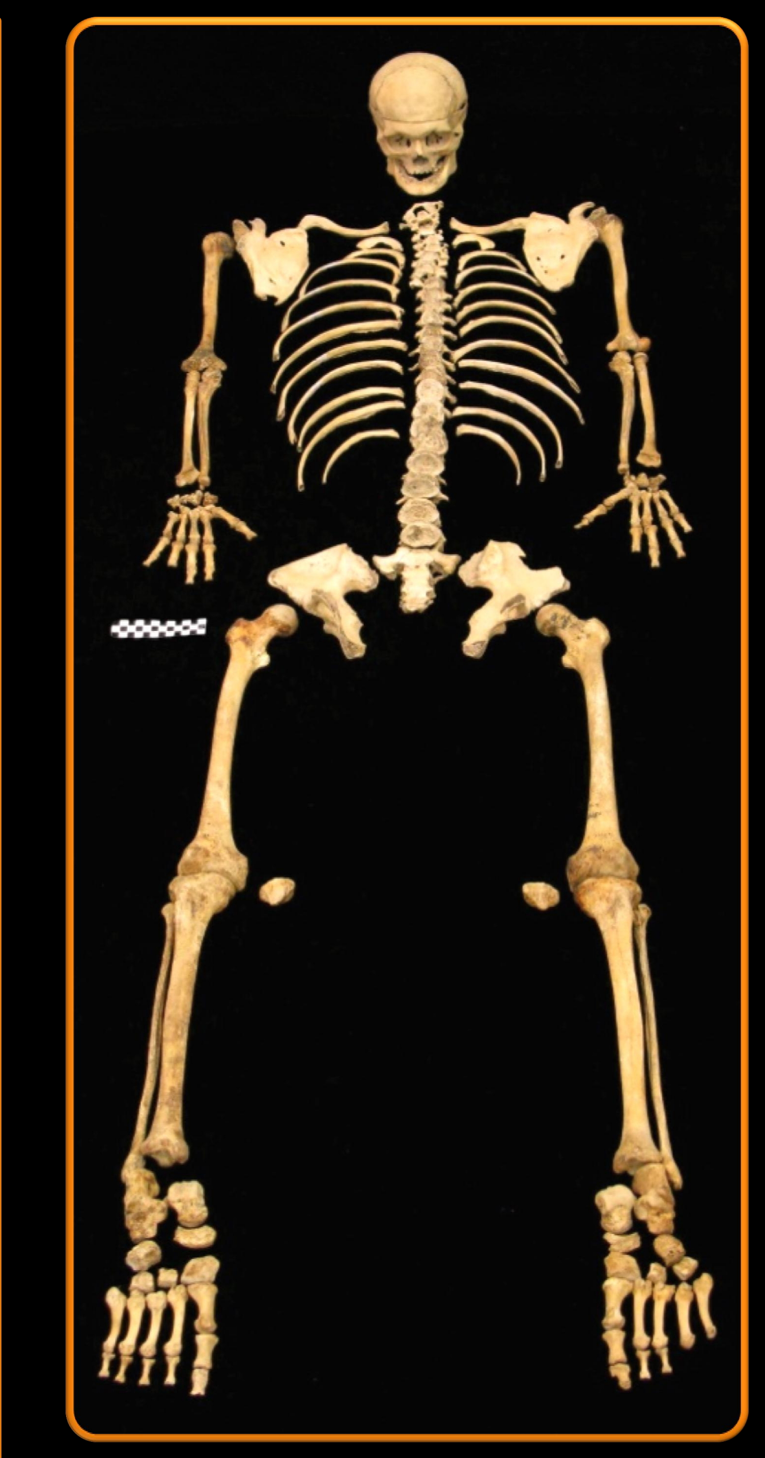
Skeleton laid out for photos.

Due to the secrecy surrounding much of the IOOF organization the identity and age of the skeleton cannot be determined more specifically at this time, but the known IOOF history tells us that the skeleton was used for initiation rites and he has most likely been in the lodge since the opening of the first lodge in Scio in the late 19th century.