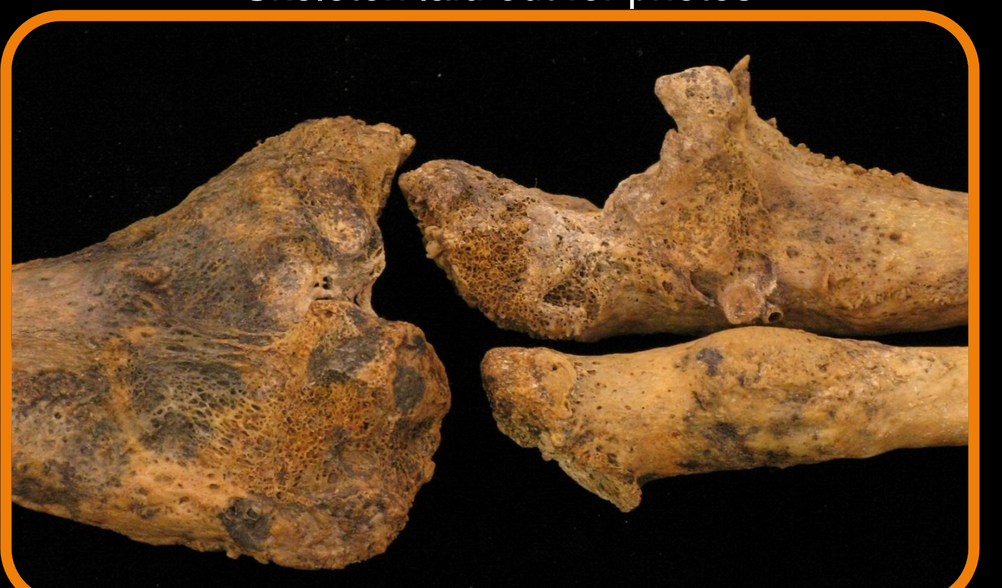
Tuberculosis lesions on the right humerus, ulna, and radius obliterating the elbow joint and L-5.