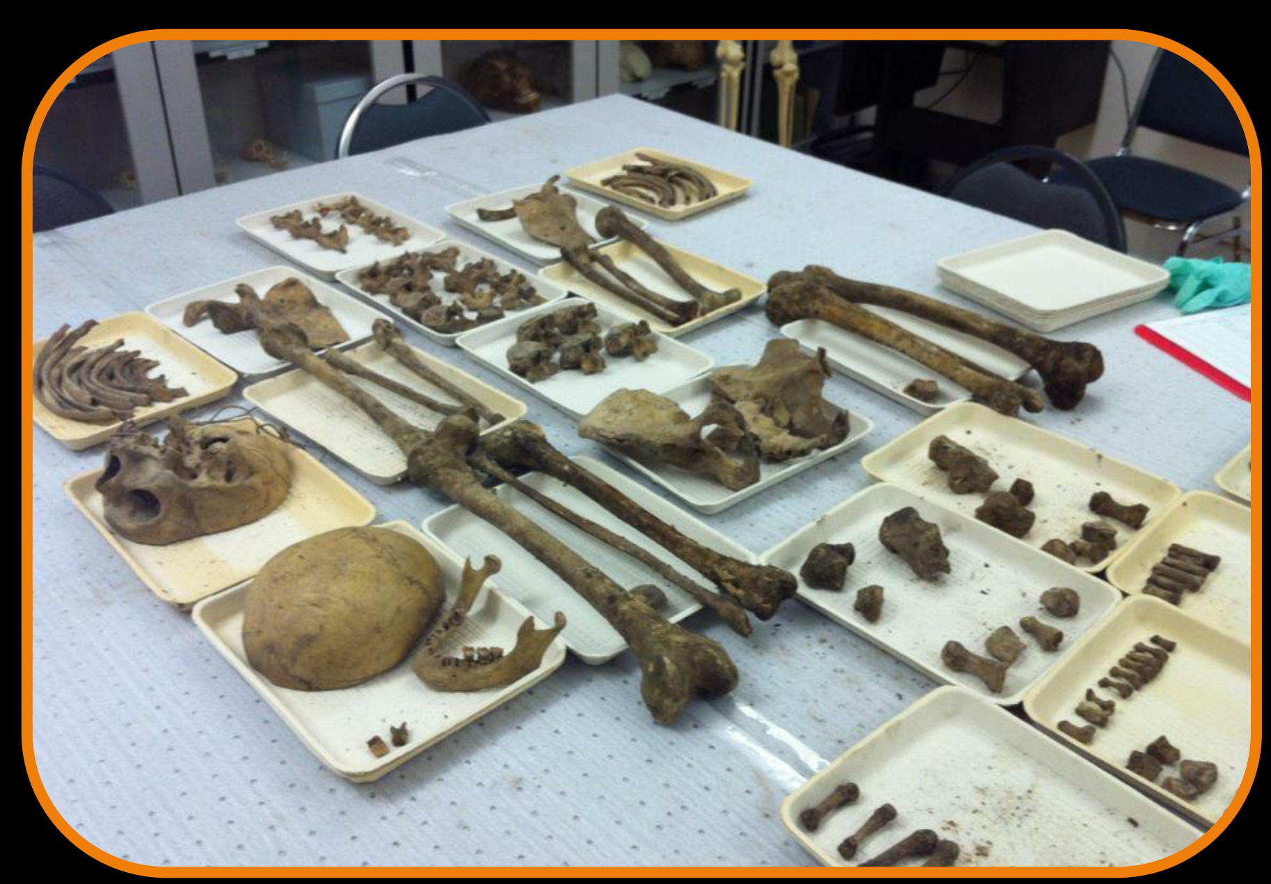
The skeleton laid out in the Bio-Cultural Anthropology Lab in