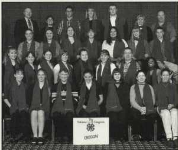
Oregon Delegation, 2000 National 4-H Congress, Atlanta, GA