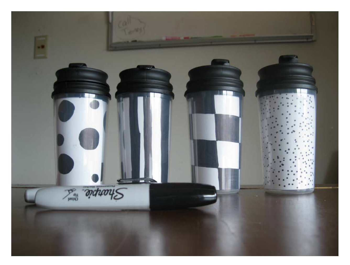
Figure 1. These are the four jars we used in the experiment. Each one had a different pattern that was drawn on with a non-toxic Sharpie. The patterns were referred to from left to right: big dots, stripes, checkers, and small dots. They were made of plastic and approved by the aquarium to be safe for the octopus to work with. The jars had screw top lids and floated in the water.