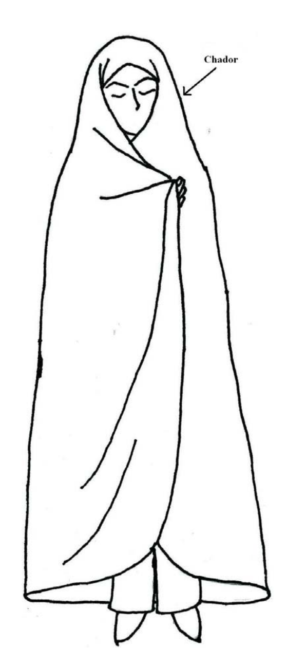
Figure 1. Chador.