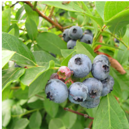
'Rubel' (northern highbush)