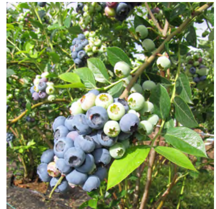
'Reka' (northern highbush)

This publication replaces OSU Extension publication EC 1308, Blueberry Cultivars for Oregon .