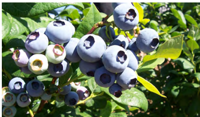
'Draper' (northern highbush)