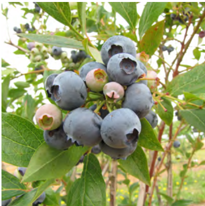
'Spartan' (northern highbush)