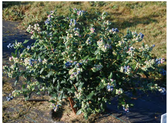
'Perpetua' (half-high, ornamental)