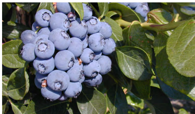
'Duke' (northern highbush)