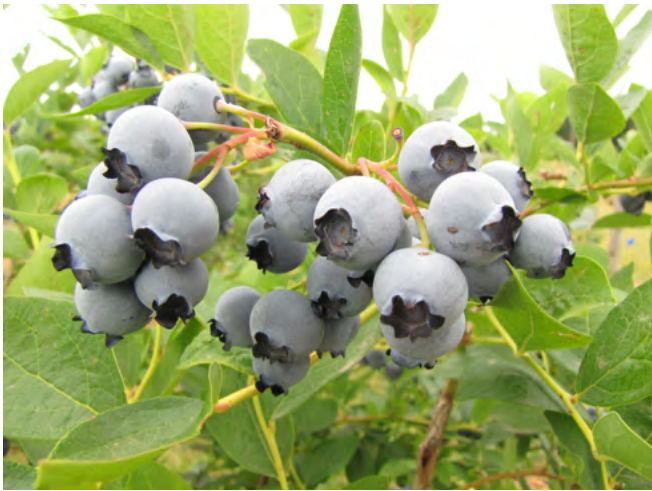
'Bluejay' (northern highbush)